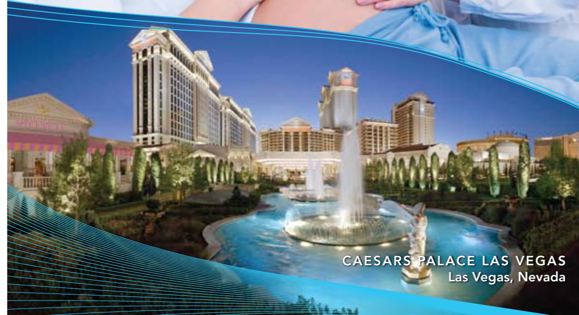
CAESARS PALACE LAS VEGAS Las Vegas, Nevada